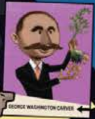
GEORGE WASHINGTON CARVER