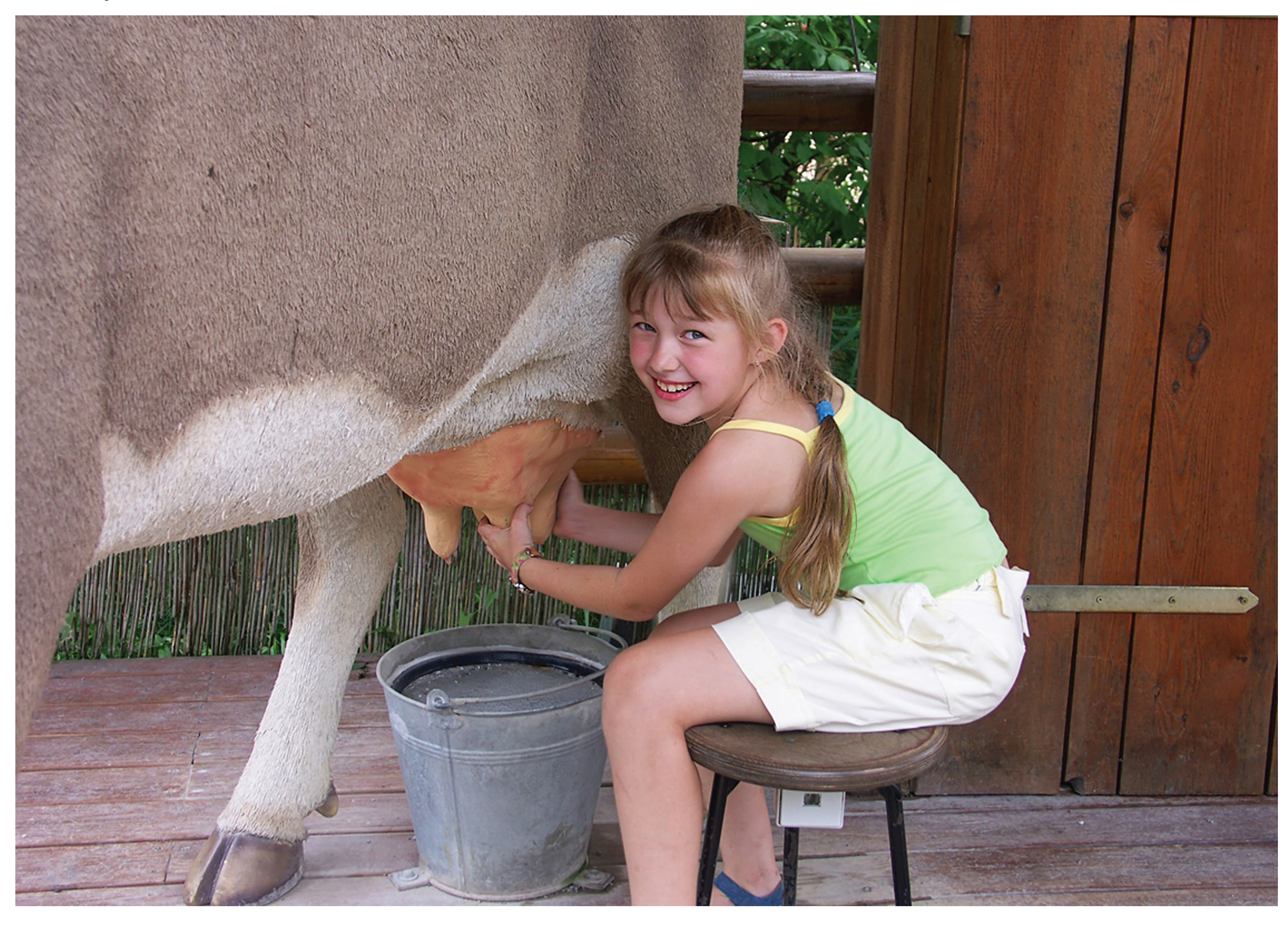
Lesson 2: Dairy Cow